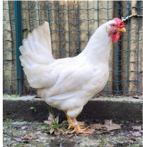
Experimental Animal Farms, UniFI