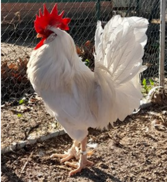
Experimental Animal Farms, UniFI